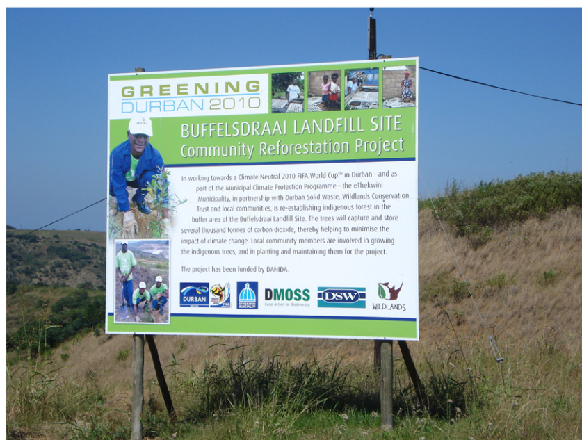
Fig. 2. Reforestation project in Durban (photo taken by author).

Although the strategic alignment of climate adaptation priorities with broader development priorities in Durban has resulted in a number of early adaptation successes, these actions have so far yielded mixed results and have often proved expensive and time consuming (Cartwright et al., 2013; Walsh et al., 2013). The focus has been on adapting to constantly evolving decision-making pathways composed of manageable and adjustable steps over time, each triggered by a change in available resources, knowledge, and response to unexpected opportunities (Leck & Roberts, 2015; Roberts, 2010). This procedural focus has allowed city officials to learn from successes and failures, and has generated a cycle of reflective practice to understand the complexity of adaptation actions (Interview, 2015). Although many of the “no-regrets” approaches – such as managing and restoring ecological infrastructure in the uMngeni River watershed and initiating large-scale reforestation programmes – are beneficial under a range of climate scenarios, such interventions somewhat bypass inherently political discussions around the trade-offs between adaptation and development.