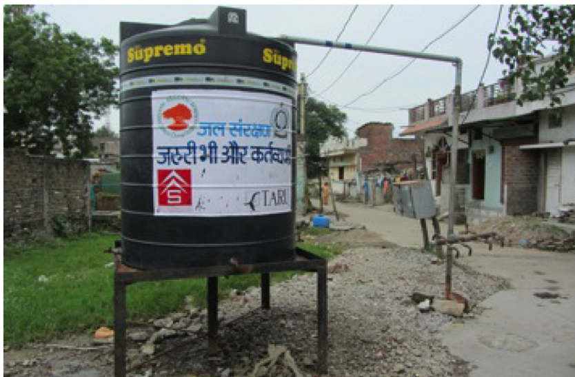
Fig. 3. A water pumping station in Indore.

Apart from improving water access in slum communities, Indore also made use of ACCCRN support to rehabilitate and conserve existing