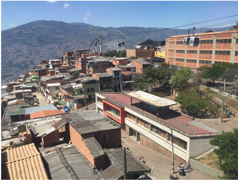
Fig. 4. An overview of hillside communities in Medellín.

tourists, and wealthier residents to the Pan de Azúcar trails, while dispossessing long-time residents of their traditional use of the space. For example, the city has built new stone and concrete hiking trails and bike paths without considering their impacts on existing walking paths built and used by local residents. Since private developers support much of the Green Belt project, local residents have voiced concerns over rising land prices, increasing taxes, and the changing social composition of neighbourhoods, all of which will introduce more socio-spatial inequities (Interview, 2016).