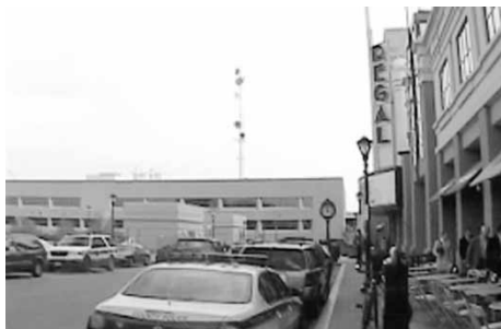
Figure 5. Scene rated low on all eight urban design qualities (Rockville, MD).