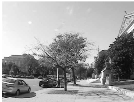
Figure 3. Scene rated high on imageability, legibility and coherence (Washington, DC).