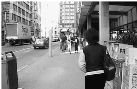
Figure 4. Scene rated high on enclosure, linkage, and complexity (San Francisco, CA).