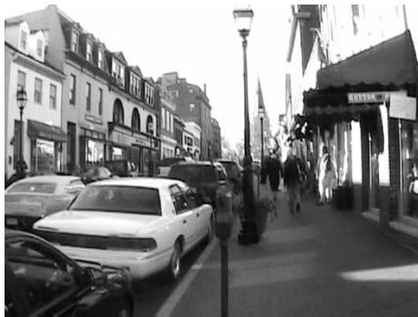
Figure 2. Scene rated high on all eight urban design qualities (Annapolis, MD).

Figures 2–5 are static images from four of the video clips, illustrating variation in urban design qualities. Clips were rated by the expert panel on a scale that represented low to high levels of each quality (1 to 5).